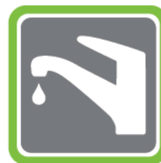
Ample Water Supply